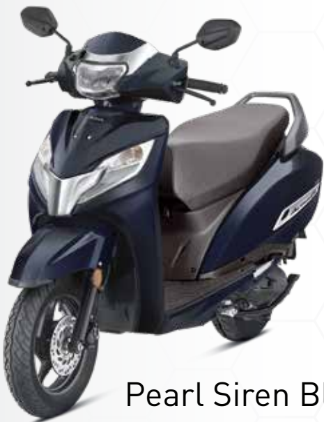
Pearl Siren Blue