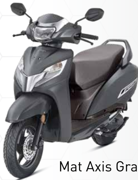
Mat Axis Gray Metallic