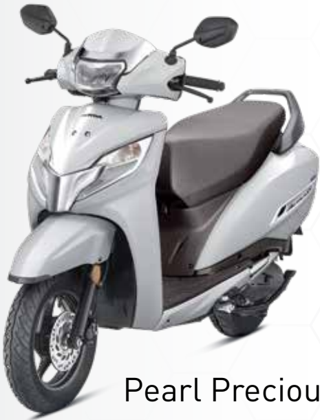
Pearl Precious White