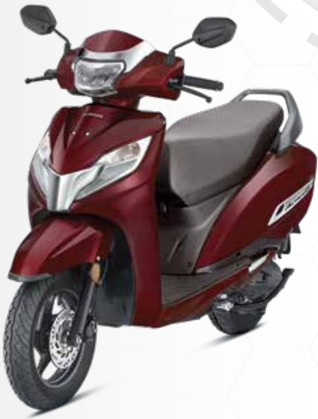
Rebel Red Metallic