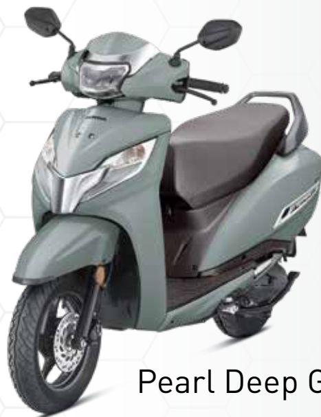
Pearl Deep Ground Gray

Mansi Honda Station Road Ankleshwar Tel: 9227285600 Mob: 9227285601